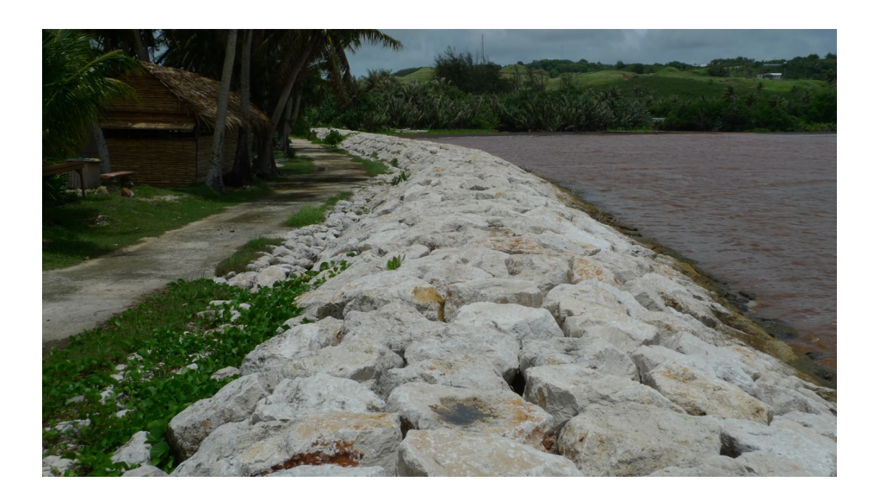
A new sea-wall on Guam (August 2010)

It is in the small island states and colonies of the Pacific that such issues appear in their full range of contradiction. As noted earlier, since a drawdown of troops in Japan, Guam has become a key node in the military visualization of the planet as a global counterinsurgency. Guam is indispensable as a link in the global networks of communication and supply, providing a permanent base in the Western Pacific. The Seabees, the Navy equivalent of the Corps, have recently built new sea walls on the island that are already in danger of overtopping at each high tide