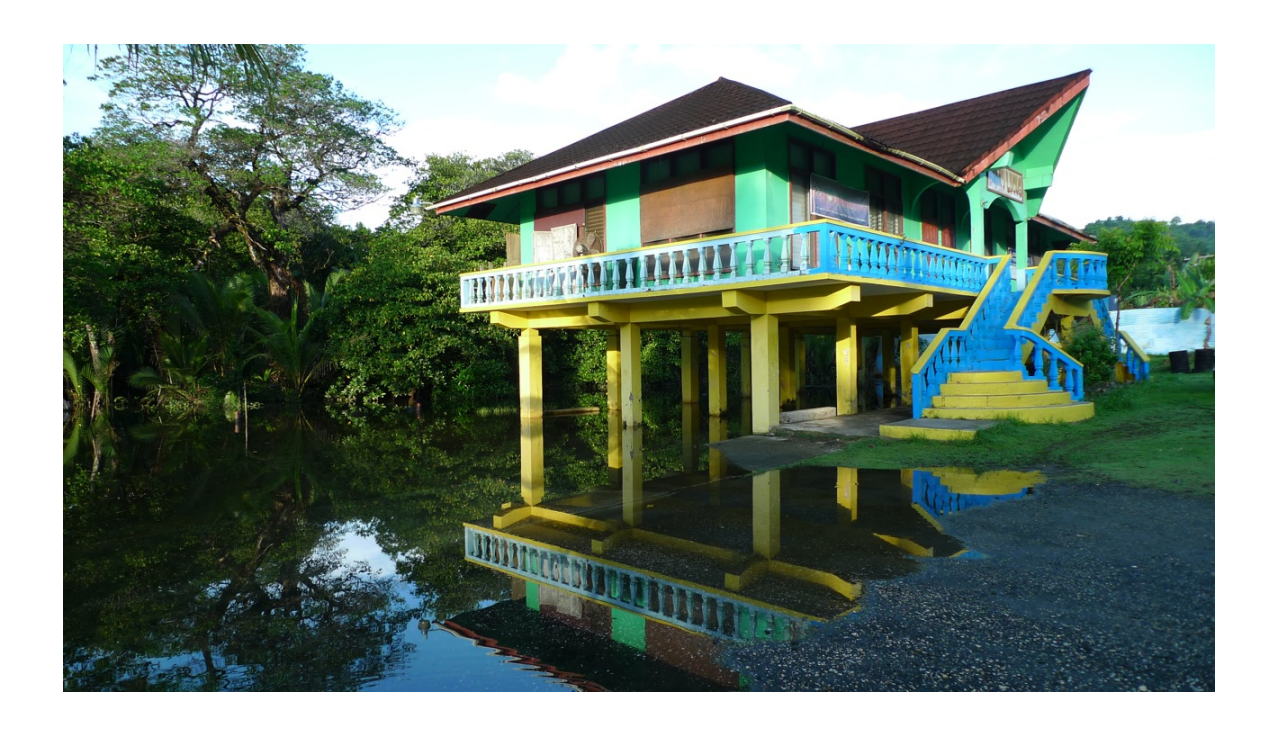
A flooded bai (meeting house), Koror, Palau (August 2010)

Even greater threats come from the salination of water and increased desertification of the archipelago, meaning that it is as likely that the islands become uninhabitable as that they flood. Given this thumbnail sketch, it is to say the least surprising that it was to Palau that the Obama administration relocated six Chinese Uighurs from the prison at Guantánamo Bay. Unable to return them to China where they would undoubtedly be persecuted but equally unable to persuade other governments to accept individuals they had themselves designated as the "worst of the worst," U. S. officials have thus adopted a place where climate change is already a catastrophe as a "secure location." Such action has been repeated on the much larger scale by the Australian government, which uses the remote Christmas Island in the Western Pacific to warehouse asylum seekers. It is one thing for the "police" to say to the people "Move on, there's nothing