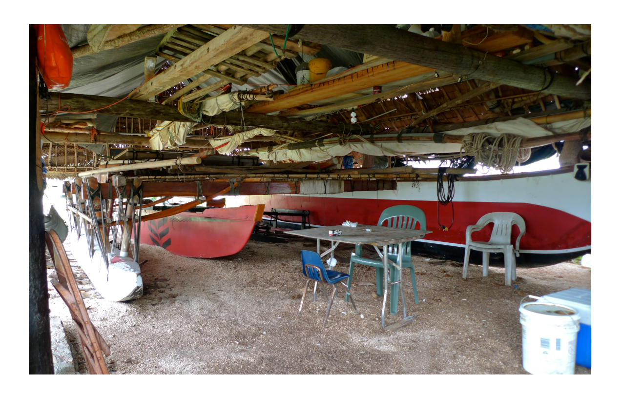
Canoe House, Guam

The Clash of Visualizations: Counterinsurgency and Climate Change.